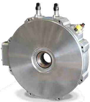
YASA-750 Traction Motor

"Somaloy is an excellent match with the YASA topology. The low losses and the manufacturability compared to laminations are important to us but so is the mechanical strength of the material. The result is a high-performance e-motor that is also very durable in a road car environment."