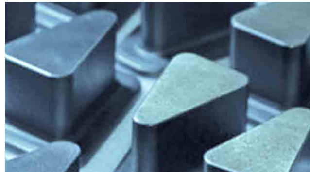
Somaloy motor components formed by SG Technologies

YASA motors found Somaloy to be the optimal material choice. The Somaloy stator core component is one of the main ingredients in their high performance motor.